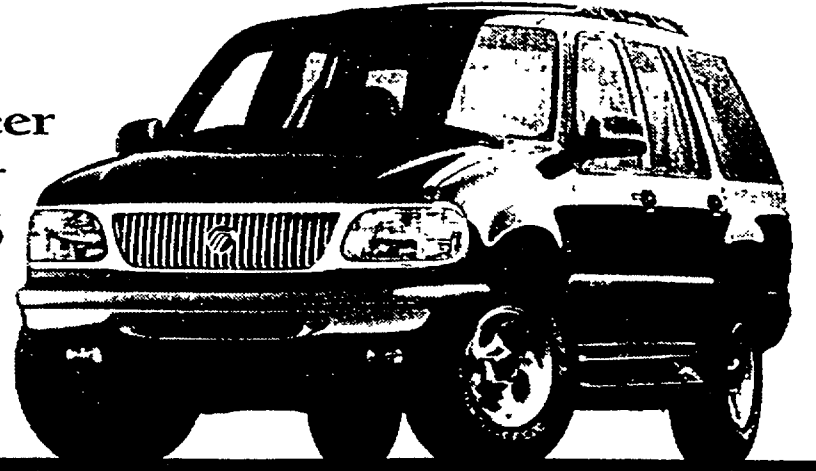
1997 Mercury Mountaineer

NEW 1997 Mercury Mountaineer With 5.0-liter V-8 Standard